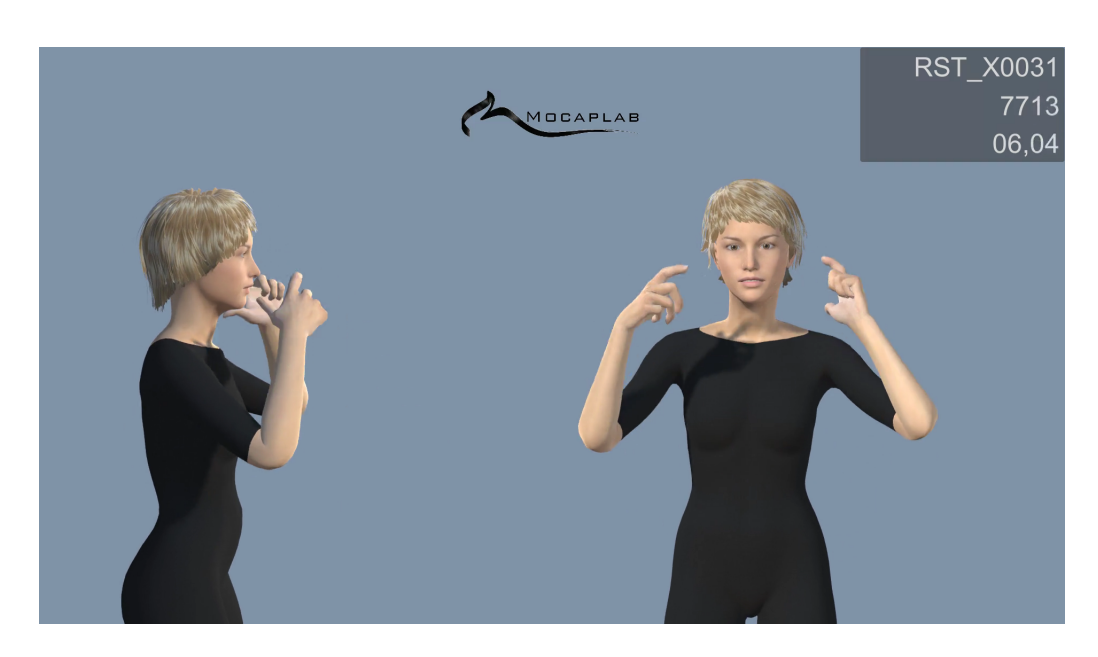
Figure 1: Avatar rendering

3https://www.ortolang.fr/market/ corpora/rosetta-lsf