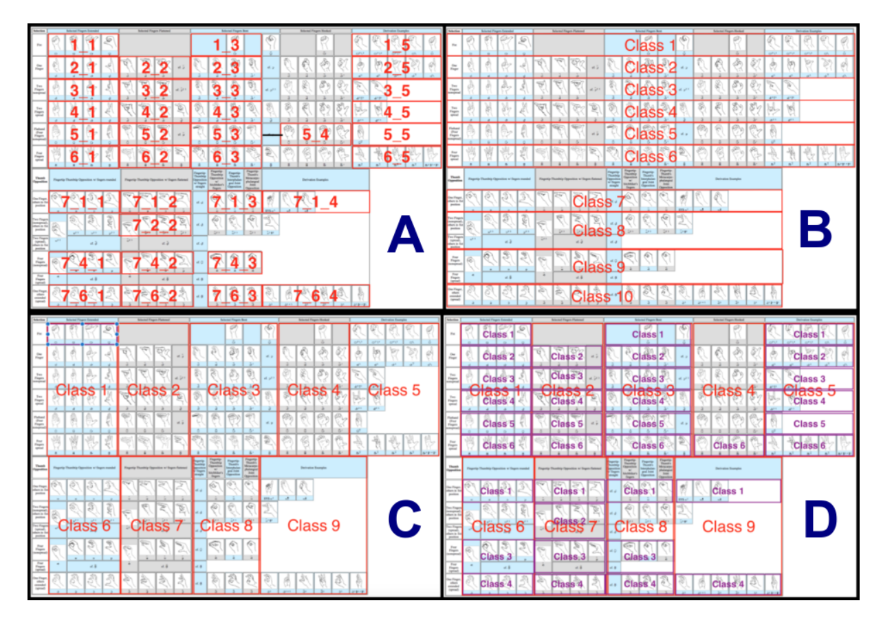
Figure 3: Different strategies for handshape categories based on HamNoSys Handshape Chart (Hanke, 2010)