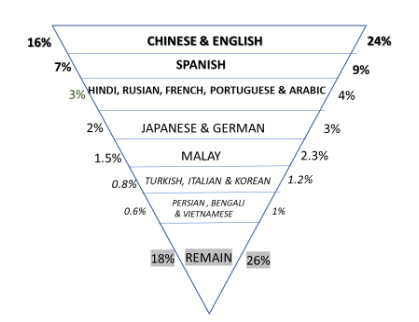
Figure 2: Percentage of contents windows for top languages

Hereafter some examples of produced data are presented, limited, for the majority of the case, to the top results. The same data is available for any of the 329 processed language. The figure 2 inverted pyramid shall be read as an expression of the confidence interval: Chinese (or English) percentage of Web contents is between 16% and 24%, all the remaining languages together represent between 18% and 26% of the total.