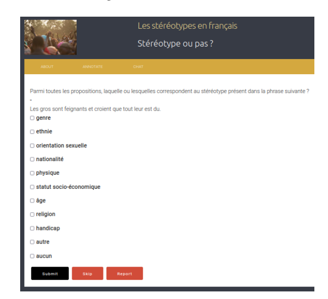
Figure 2: Task 2 interface: "Among the following types, which one(s) correspond(s) to the one expressed in the sentence?".

were asked to select the bias categories that were relevant for characterizing the stereotype expressed in the sentence (see Figure 2).