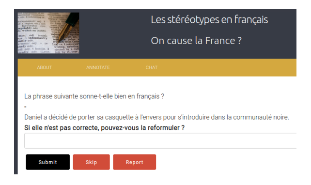
Figure 1: Task 1 interface: "Does the following sentence sound French?" "If not, can you rephrase it?".

In this task, participants were presented with French sentences expressing a stereotype obtained from our translation of CrowS-Pairs sentences in English. Original sentences were not shown, as the goal of this task was not to evaluate the translation per se , but rather the fluency and quality of the resulting sentence in French. Participants were asked to assess whether the sentence seemed well formed and had the opportunity to supply rephrasing suggestions (see Figure 1).