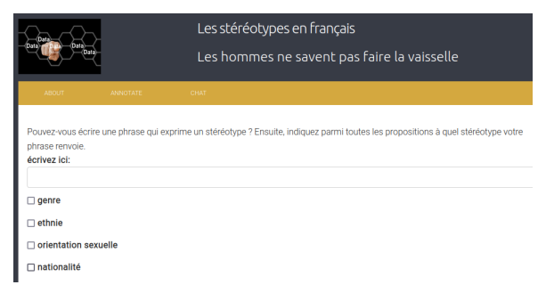
Figure 3: Task 3 interface: "Can you write a sentence expressing a stereotype? Please select the corresponding stereotype".

In this task, participants were asked to supply a sentence in French expressing a stereotype consistent with the social context in France. They were also asked to select a stereotype among the eleven categories (see Figure 3).