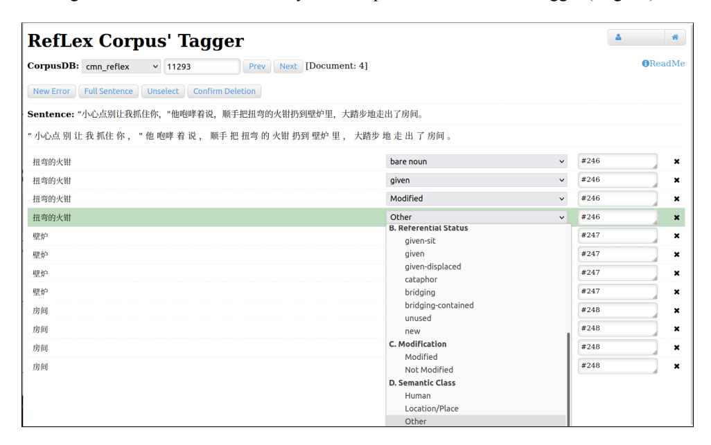
Figure 2: IMI RefLex Tagger (Mandarin Chinese): view of dropdown box with flexible tagging schema

noun phrase is modified and some information regarding the semantic class of the noun, whether it refers to human, location, or others. For a simple illustration, an English example is given below: