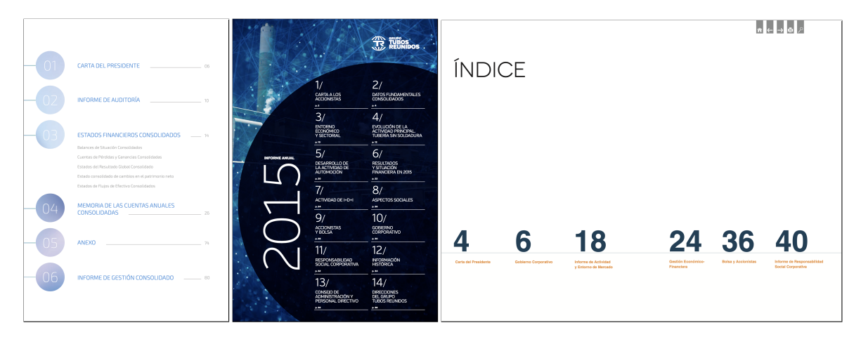
Figure 1: Examples of TOCs in Spanish documents