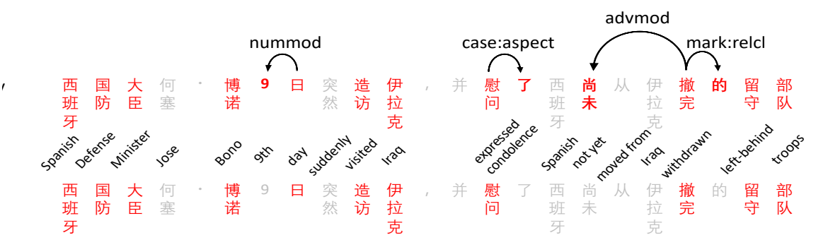
Figure 1: Chinese dependency tree transformation. Red words in the lower of the figure are identified keywords before dependency tree transformation, which forms a disfluent and semantically incorrect compression, while Red words in the upper of the figure are retained words after dependency tree transformation.