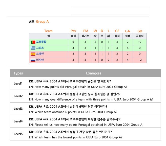
Figure 3: Examples of a natural language question set related to a table for football match-results in UEFA Euro 2004 according to question levels

KR: UEFA 유로 2004 A조에서 승점이 6점인 팀은 어 디인가? (EN: which team obtained 6 points in UEFA Euro 2004 Group A?). We include these various types of questions for improvement of model performance since our model tends to produce a lower performance on the type of Level3 question than Level1. A variety of sentence expressions such as honorific, informal, colloquial, and written formats are used in the Korean language. To enhance the robustness of our model to various types of natural language questions, we incorporate sentence variations of the questions in the other levels by changing adverbs or prepositions, replacing them with synonyms, inverting word orders, or converting sentences into honorific expressions, formal and informal languages. Numeric data such as numbers, ranks, money, or dates are stored in tables. For these tables, we generate questions related to operations (minimum, maximum, count, or average) for columns, for example, KR: 승점이 가장 낮은팀은 어디? (EN: Which team has the lowest points in UEFA Euro 2004 Group A?).