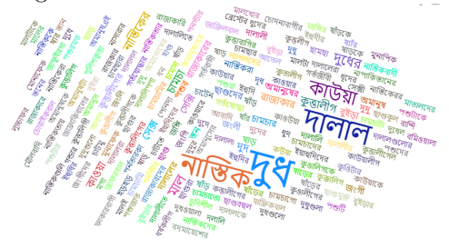
Figure 2: Non Traditional Swear Word Cloud