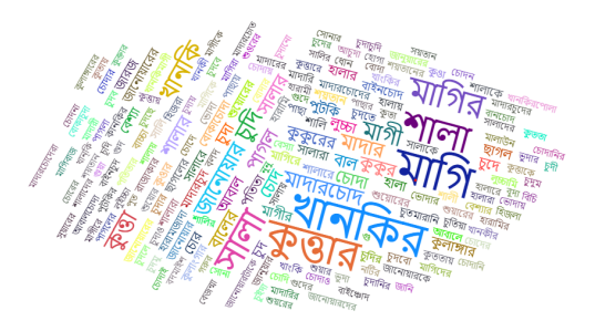
Figure 1: Traditional Swear Word Cloud