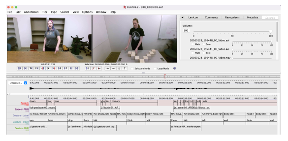
Figure 4: ELAN annotation environment for Gesture AMR, with EGGNOG videos.

At publication, annotation for standard, speech AMR and Gesture AMR is in progress on the EGGNOG corpus. For our initial annotation, we compiled a small subset of the EGGNOG corpus, containing 21 videos, with a total length of 23 minutes. The ELAN environment allows a single annotator to complete both tasks within the same working session. We use the Smatch metric to measure inter-annotator agreement on both the speech and Gesture AMR. (Cai and Knight, 2013). We additionally perform manual agreement analysis