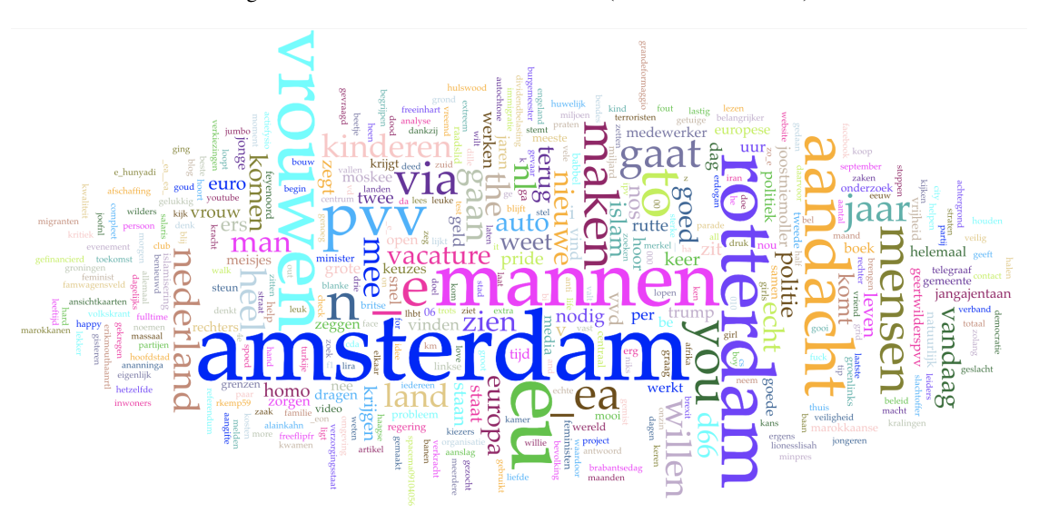
Figure 3: Word cloud of filtered dataset (125 words are shown)