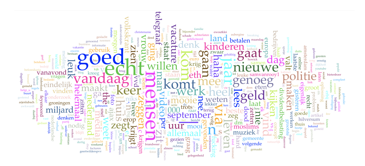
Figure 2: Word cloud of unfiltered dataset (125 words are shown)