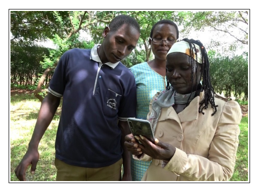
Figure 4: Local researchers practice using ODK

During a five-day language documentation training workshop, all local researchers were given instruction on the use of ODK for metadata creation. Local researchers practiced entering data, saving forms, and uploading to