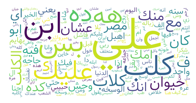
Figure 1: A word cloud of unigrams in our extended training offensive data (AUG-TRAIN-OFF).

hateful words do not include direct names of groups since these were primarily our seeds that we removed before we prepare the word cloud. Overall, the clouds provide sensible cues of our phenomena of interest across the two tasks.