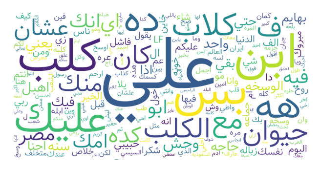
Figure 2: A word cloud of unigrams in our extended training hate speech data (AUG-TRAIN-HS).