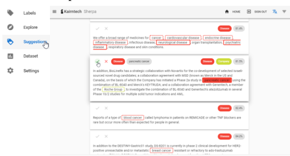
Figure 1: The Sherpa GUI presents the content as easy-to-consume snippets of text to be annotated by the user. Asking for new "suggestions" applies the current ML model which is continuously refined in the background.

A prime focus in the design of the Sherpa was therefore making this process of annotating content as easy and effortless as possible.