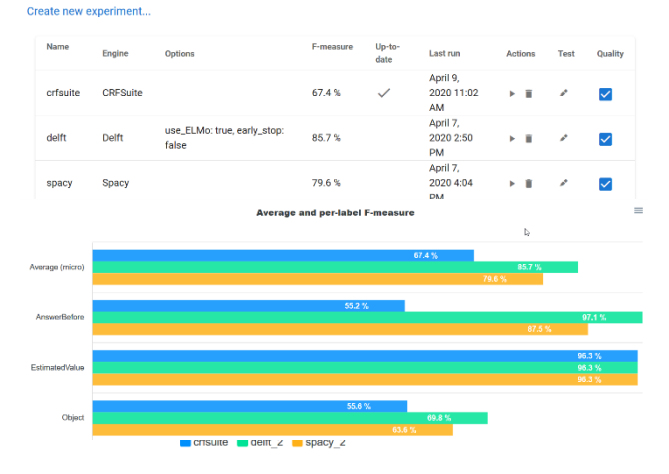
Figure 4: The Sherpa GUI provides the user with an overview about the respective quality reached by different algorithms launched on the same task.

The Sherpa provides users with an overview of the development and the latest training successes of the various employed options. Users can also rely on the fast CRF approach to quickly refine a model that constantly presents new text snippets for manual annotation and once enough snippets have been annotated, launch a longer training run with the more resource-intensive Deep Learning libraries. This way of combining the various strengths and weaknesses of different ML approaches would normally require considerable technical ML expertise – we have chosen to offer that to also less or non-technical users as part of the Sherpa user interface.