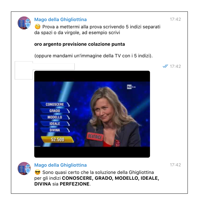
Figure 2: A screenshot from Telegram in solution mode: Mago della Ghigliottina accepts the picture containing the five clues and in 1-2 seconds returns its prediction with a degree of accuracy. In this case, the system correctly guesses the solution because of the following MWEs i) conoscere alla perfezione (to perfectly know), ii) grado di perfezione (degree of perfection), iii) modello di perfezione (model of perfection), iv) ideale di perfezione (ideal of perfection), and v) perfezione divina (divine perfection).

Mago della Ghigliottina is automatically tested every day on the TV show instances and is able to guess the solution correctly about 2/3 of the time. It must be considered that every day several users submit the same instance of La Ghigliottina game, so this performance has been calculated discarding duplicates. The bot definitely outperforms humans in solving the game. In comparing the performance of our AI system with that of a top player, we analyzed the games played by Andrea Saccone, who has been the biggest champion of the Ghigliottina game so far: he was champion for 13 days (3-15 March 2018), and he managed to