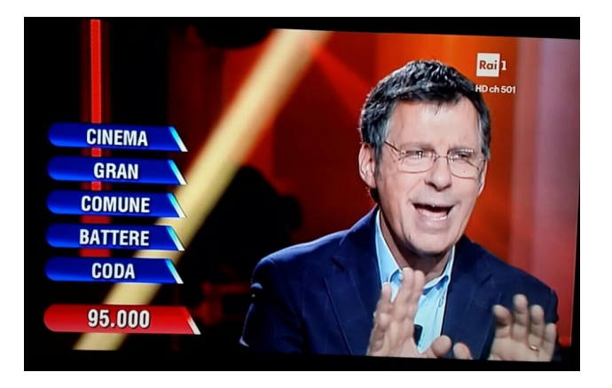
Figure 1: A screenshot of La Ghigliottina . In this case, the solution is cassa : i) cassa del cinema (cinema box office) , ii) grancassa (bass drum) , iii) cassa comune (petty cash) , iv) battere cassa (beat the check) , and v) coda alla cassa (checkout line)

with the five clues. The five clues are unrelated to each other, but each is in relation with the solution. In figure 1 we show an example of the game.