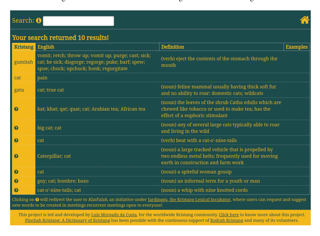
Figure 3: Screenshot of Pinchah Kristang 's Search Results for 'cat'

which are deemed compositional in English (ten + o'clock), and hence do not have a concept in PWN.