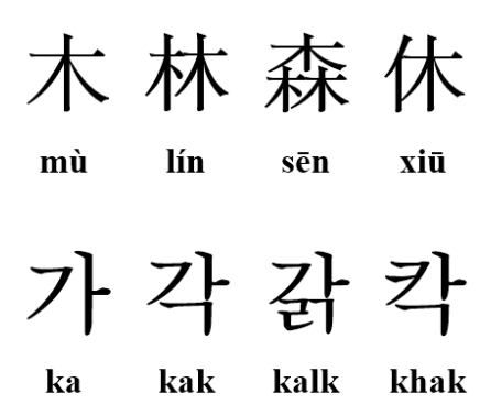
Figure 1: Comparing the Chinese language written with Hanzi (along with pinyin , top) and the Korean language written with Hangul, the featural writing system (along with Yale romanization, bottom).

In a little different viewpoint notwithstanding, Hangul representation of Korean is a featural writing system (Daniels and Bright, 1996) in which each sub-characters of morphosyllabic blocks corresponds to a phonetic property (Figure 1, bottom) (Kim-Renaud, 1997). For instance, in a syllable khak placed at the right end of the bottom of Figure 1, the three clock-wisely arranged characters kh, a, and k, which sound khiukh (among 19 candidates), ah (among 21 candidates), and kiyek (among 27 candidates), refers to the first, the second and the third sound of the given character, respectively (Cho et al., 2019). This is a unique feature of the Korean writing system, which distinguishes Hangul from Chinese characters that do not have a direct relationship with syllable pronunciations. Also, Hangul is more delicately decomposed compared to mora-level Japanese Kana. Due to the above characteristics, the process of transforming grapheme in Korean to phoneme is widely performed by using the Korean alphabet itself (Jeon et al., 1998; Kim et al., 2002), that is, the Hangul sub-character Jamo, unlike cases such as Chinese pinyin that borrows the English alphabet (Figure 1, top). For this reason, even though the widely used Korean G2P sometimes uses English expressions (Cho, 2017), the full phoneme sequence is primarily