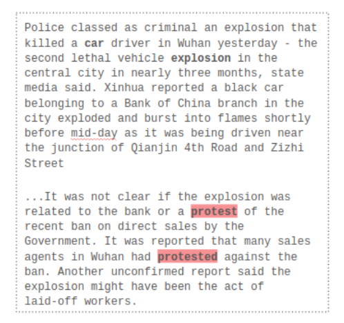
Figure 2: China news sample.

issues. In this case, very important parts of the data might be lost. For example, the news sample in Figure 2 was classified falsely as "non-protest", since the "protest" keyword was clipped due to the limitation to maximum number of tokens.