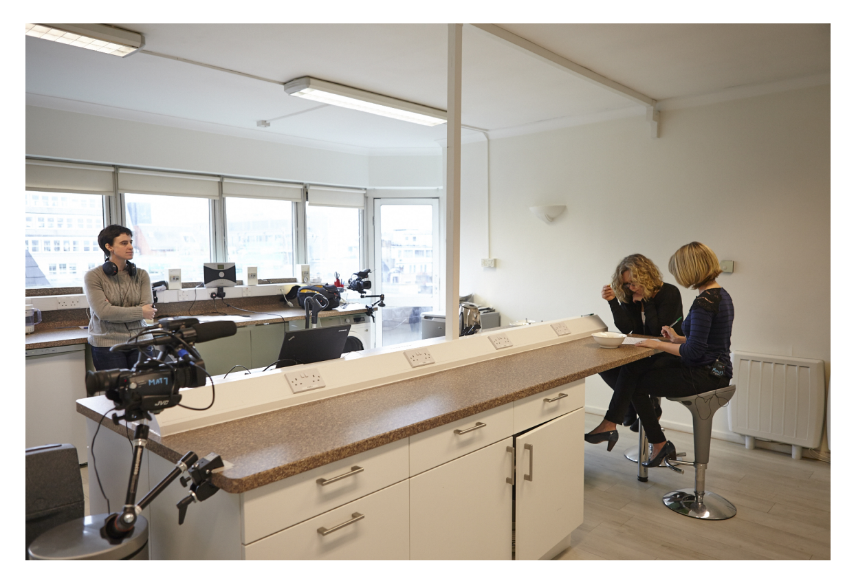
Figure 3: Session in progress (Original Scene)

(Spontal corpus), and the IFA dialogue video corpus (IFADV) in Dutch are examples of multiple-angle recorded data, but they focus either on social function or only on the referential functions (Brône and Oben, 2014). In the current study, we combine these two functions where reference is part of the interaction. This is more common in a natural multi-modal dyadic dialogue and uses two cameras to gain access to multiple angle interactions that allow analyses of fine-grained, reliable behavioural features.