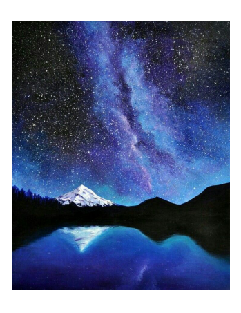
Figure 1: Illustration I

Unaddressed participants also display interesting gaze be-