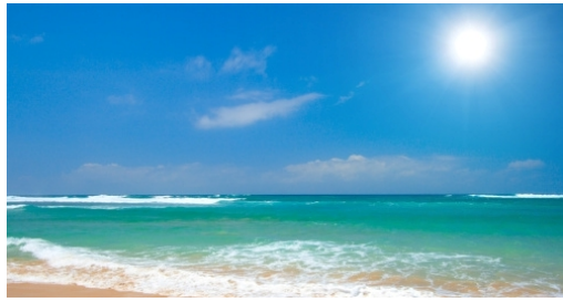
Figure 2: Illustration II

haviour showing that they anticipate turn shifts between primary participants by looking towards the projected next speaker before the completion of the ongoing turn (Holler and Kendrick, 2015). This may be because gaze has a 'floor apportionment' function, where gaze aversion can be observed in a speaker briefly after taking their turn before returning gaze to their primary recipient closer to turn completion (Kendon, 1967; Brône et al., 2017).