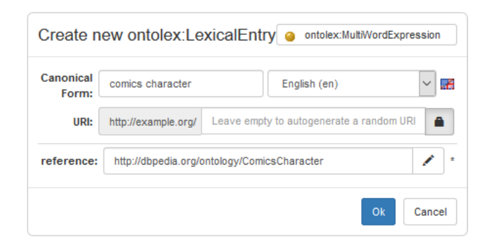
Figure 5: Dialog for the creation of the class noun "comics character"

In our introductory example, the lexical entry "comics character" (see Figure 1) is connected to its tokens through the property decomp:constituent, as well as through the properties rdf:_N (required to encode the order of the tokens). In the resource view (see Figure 4) these properties are separated (obeying to a triple-oriented perspective), nonetheless the values of the property decomp:constituent are ordered based on the information provided by the RDF membership properties. Following McCrae et al. (2012), we provided a dedicated editor to manipulate the sequence of tokens as a whole, while the system takes care of low-level triple updates.