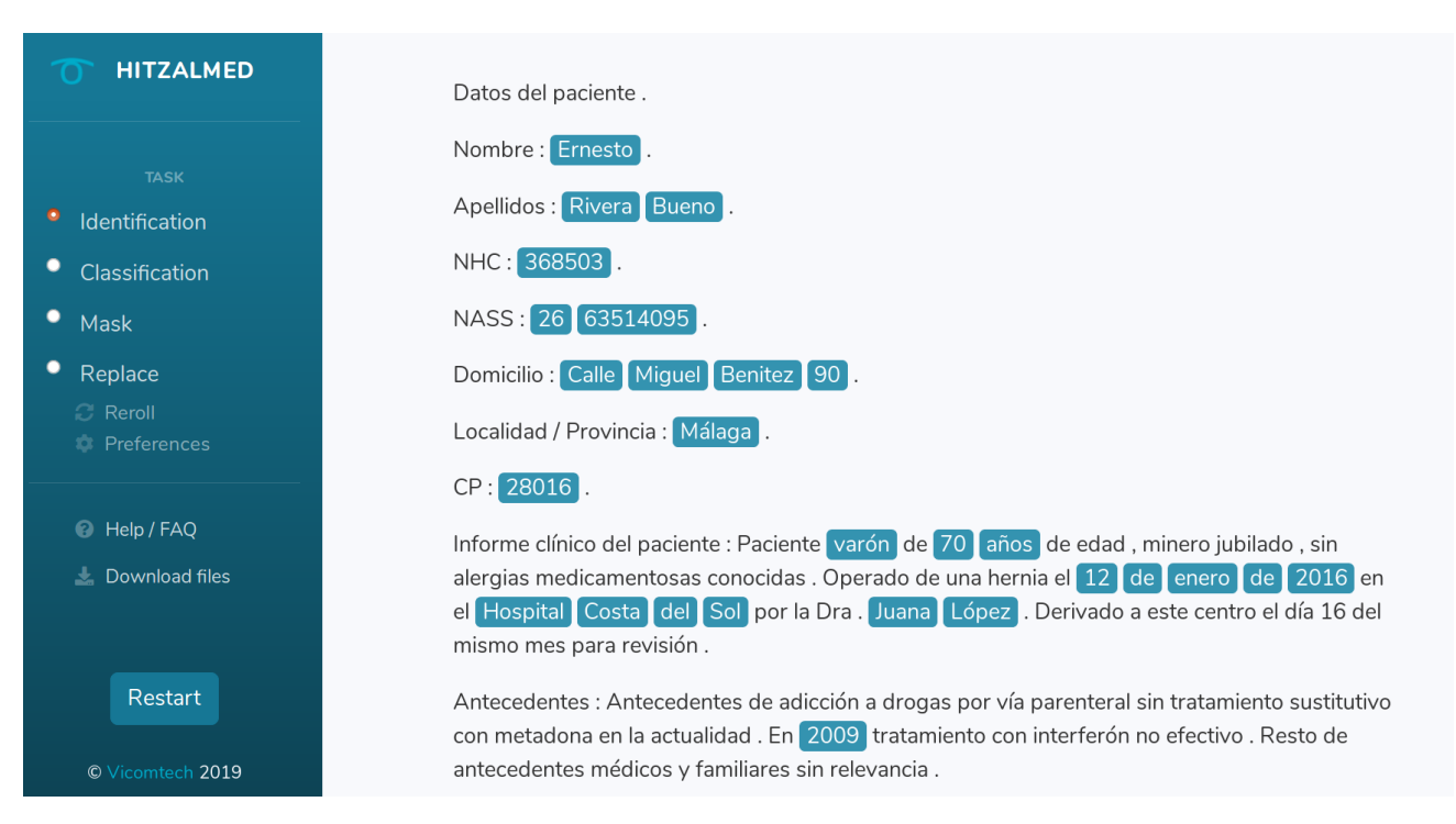
Figure 2: HITZALMED overview