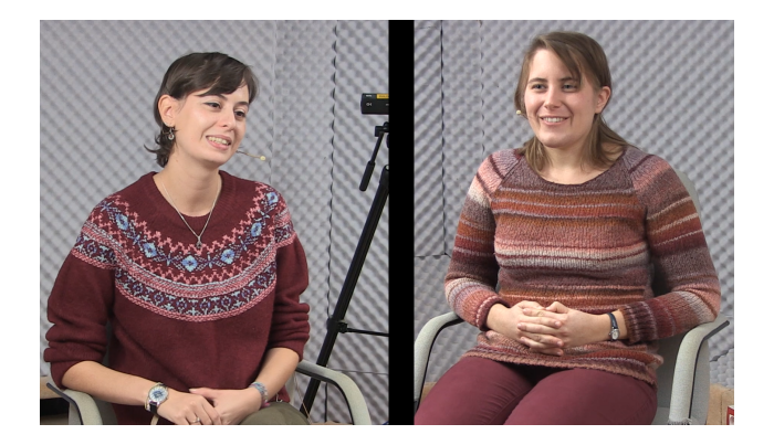
Figure 3: Example of the merged video for one interaction of PACO.

As a result, we obtained 30 videos of each participant in m \times f format that we have converted in mp4 for an easier post treatment (Elan software among others (Sloetjes and Wittenburg, 2008)). The image resolution is 1920x1080 px. A video editing software (Adobe Premiere Pro CC) was used to merge the two videos of each interlocutor of an interaction into a single one (see figure 3) in order to consider a multimodal annotation of the whole interaction. In the scope of being shared, the audio and the video files will be publicly available in the Open Resources and TOols for LANGuage (ortolang.fr) repository.