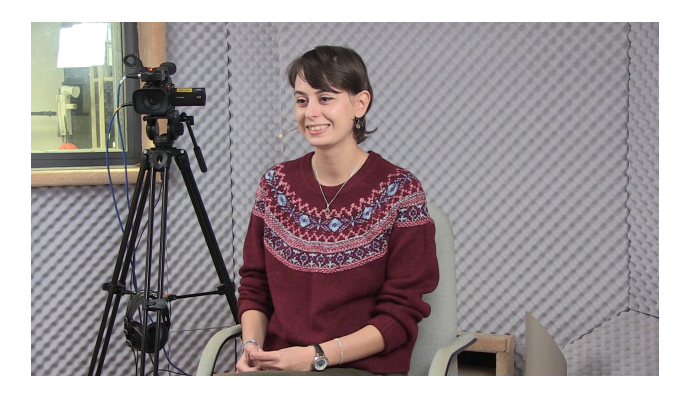
Figure 2: Example of the scene configuration for one participant of PACO.

Two tasks were delivered to the participants: first, they were asked to read each other a canned joke (Attardo et al., 2011); second, they were asked to converse as freely as they wished for the rest of the interaction. Our double instruction constitutes a strong advantage. The reading task allows us to have similar linguistic material for all speakers. This allows us to identify how the first thematic transition to the second conversation task is negotiated and to analyze how speakers manage their first speech turn (auto/hetero selection) (Sacks et al., 1978) to the conversational sequence. The second conversational task without any predefined topic allows to observe how the conversational topic are negotiated depending on whether or not the participants know each other. This experimental protocol leads to a very high quality data-set in term of video and audio records. Indeed, as each participant is recorded in one audio channel with a sampling frequency of 48000Hz, it facilitates the transcription steps and eventually the automatic annotations based on the audio signal (.wav). Moreover as each participant is filmed with one camera (see figure 2), it is possible to consider a precise gesture annotation and eventually an automatic post-treatment (see section 4.1).