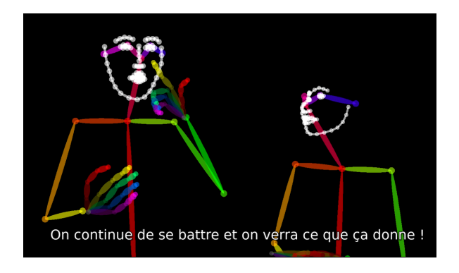
Figure 1: Frame from MEDIAPI-SKEL

challenges appropriate for MEDIAPI-SKEL.