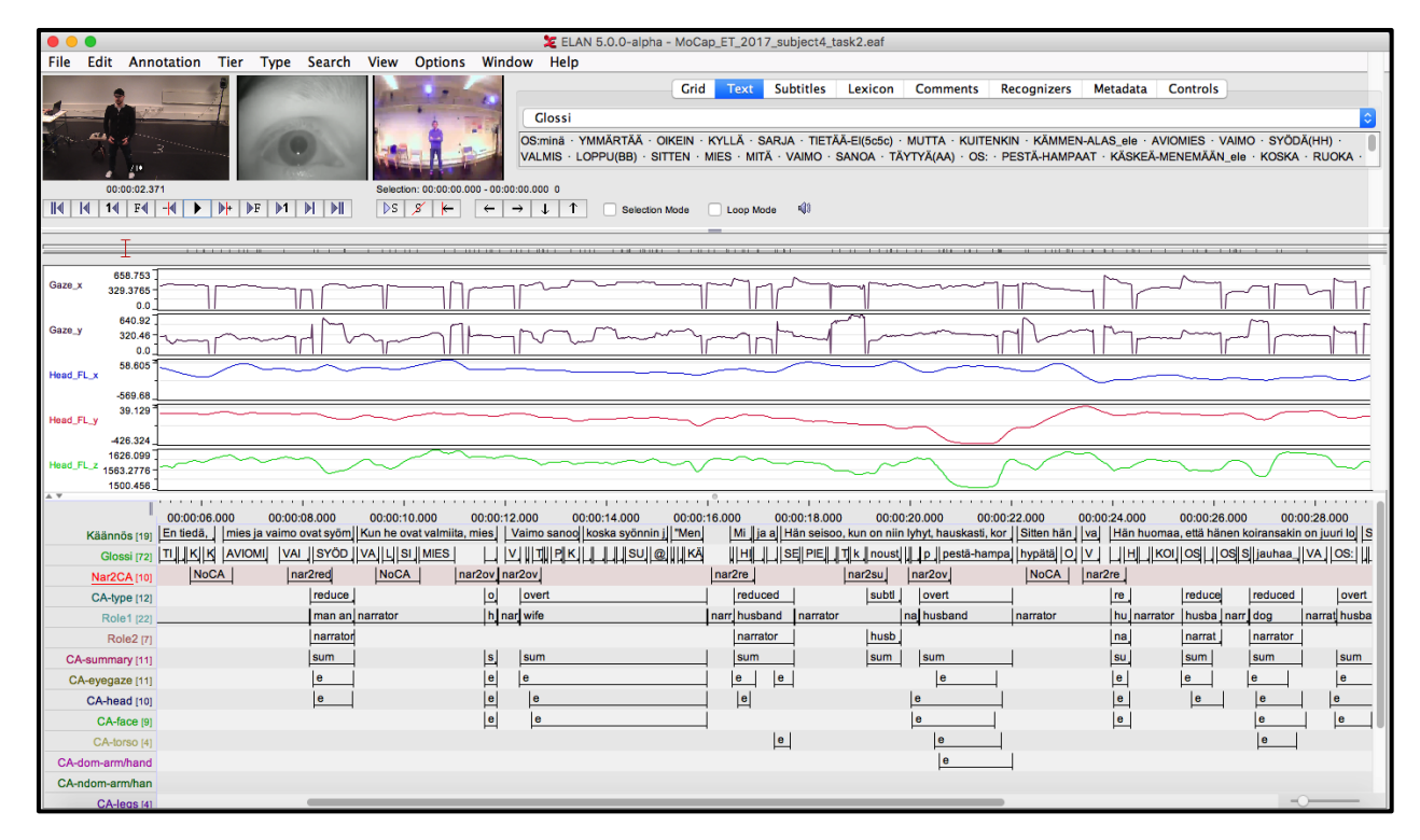
Figure 2: ELAN screenshot showing video (top left corner), visualized ET and MoCap data (track panels in the middle) as well as annotations (bottom half of the screen).

For the present work we use altogether seven stories produced by two signers (both male, aged between 30 and 40). The duration of the videos in this data set totals five minutes. The size of the corresponding MoCap material is approximately 200 million characters and the size of the ET material is approximately one million characters. The reason for limiting the study to only seven stories produced by two signers was technical: the remaining ET material included disruptions which prevented the full use of the automatic synchronizing function in Matlab (see Burger, Puupponen & Jantunen, 2018).