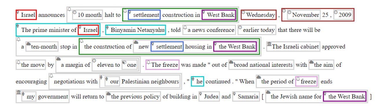
Figure 1: Xrenner's coreference and entity predictions on an AMALGUM news snippet. Coreferent mentions are colored (e.g. Israel and the prime minister of Israel are boxed in red and cyan), and entity types are indicated by icons: PLACE \mathbf{Q} , PERSON \mathbf{\dot{\mathbf{n}}} , TIME \mathbf{O} , EVENT \mathbf{\dot{\boldsymbol{\Delta}}} , ABSTRACT \mathbf{\bullet} , and OBJECT \mathbf{\hat{\boldsymbol{\nabla}}} .