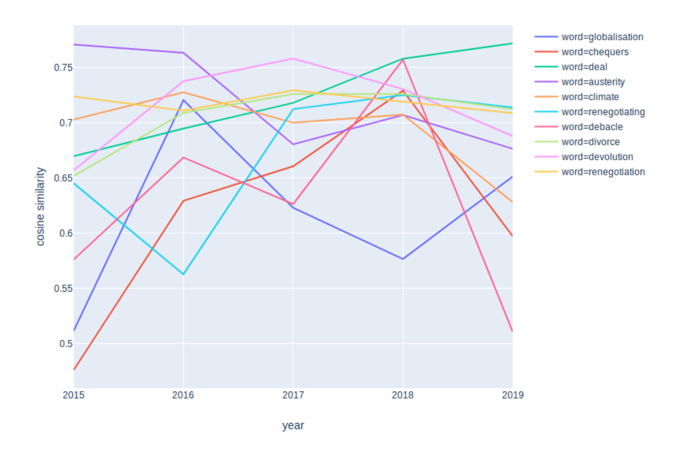
Figure 2: The relative diachronic semantic shift of the word Brexit in relation to ten words that changed the most out of 50 closest words to Brexit according to the cosine similarity.