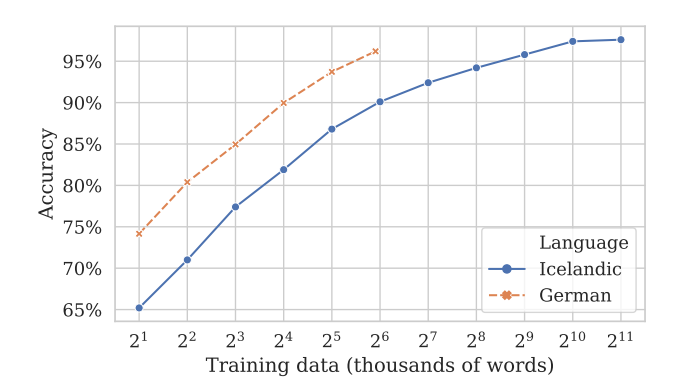
Figure 3: Accuracy of the two-layer BiLSTM model for a varying amount of training data.

Finally, we evaluate the two-layer BiLSTM model using a varying amount of Icelandic and German training data. We start off by evaluating the accuracy of our model on a training set of 2,000 words, doubling the amount of training data thereafter. We add words to the training data from the complete training set in a decreasing order of frequency, using word frequencies from the Icelandic Gigaword Corpus (Steingrímsson et al., 2018) and from the German Wikipedia<sup>3</sup>. The results of this evaluation can be seen in Figure 3.