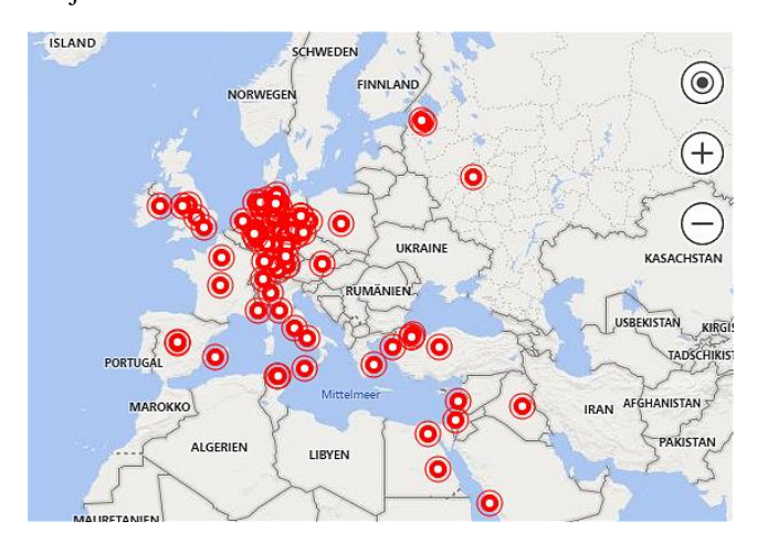
Figure 3: Distribution of location names.

simply describes a luxurious palace. But starting with the mid-80s, the ironic use of Luxusburg for the wealthy little state in central Europe can be verified in various newspaper and journal articles.