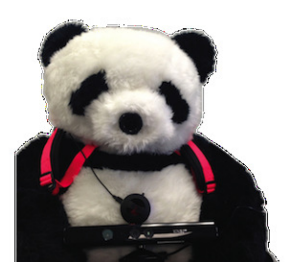
Figure 2: Prototype of our companionbot that is placed in the participants' room for them to interact with.