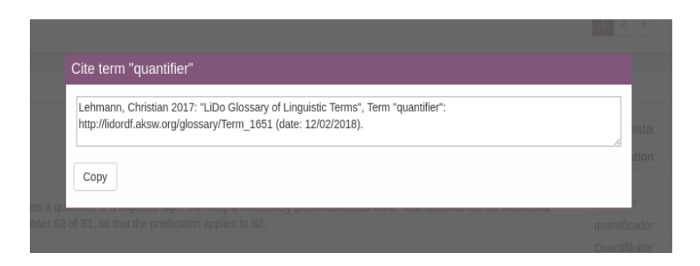
Figure 3: Screenshot of the citation function for the English term quantifier provided within the web interface.

The different layout presents just another option next to the existing LiDo TBD website. The design and features are still under development and might change if the user feedback demands refinements or other additional functionalities.