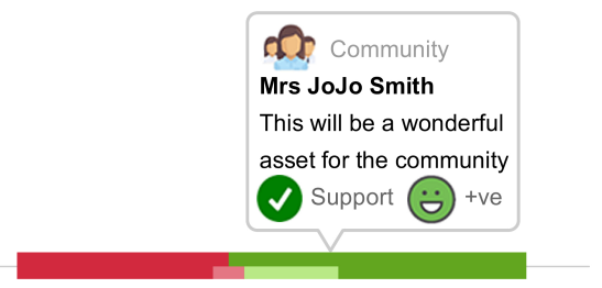
Figure 3: User exploration is supported through interactivity of the graphs on mouse-over. A fly-out box shows more detail of how the chart is constructed by displaying an abridged comment, sentiment and stance.

While doing so hides the absolute value of the number of comments made for each of the sentiment and stance classes, it enables a visual comparison of the relative swing across each topic. Following Shneiderman's Information Seeking Mantra ("overview first, zoom and filter, details on demand") (Shneiderman, 1996), this approach enables the user to interactively explore the information in a flexible manner. The default view of the sentiment and stance