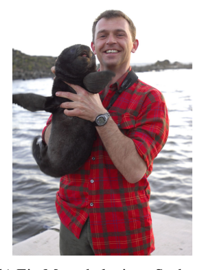
(b) Ein Mann hält einen Seehund

Figure 2: Two different translations of "A man is holding a seal" depending on the visual context