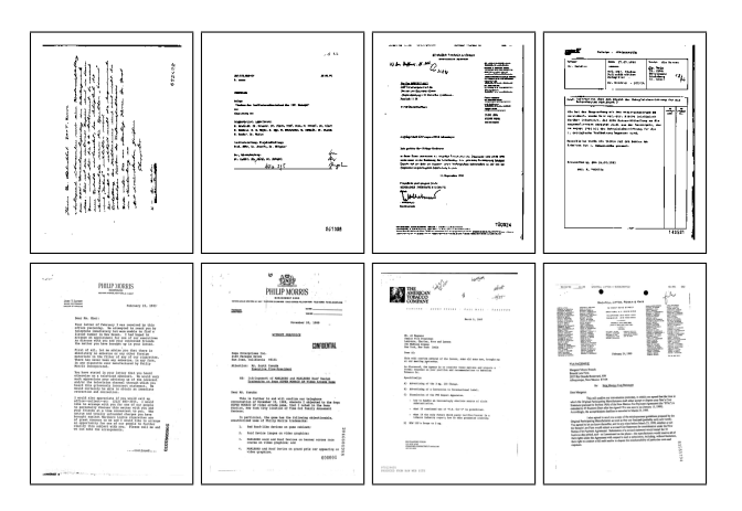
Figure 1: Examples for first pages (class new document ); from Archive22k (above) and Tobacco800 (below).

After batch scanning, about 40 % of all binders from the German research archive have been manually separated into documents and annotated with document categories. The manually separated documents can serve as a ground truth for our experiments on model selection and feature engineering for automatic page stream segmentation. For these experiments, we randomly selected 100 binders from the set of all manually separated binders. The binders represent 100 ordered streams of scanned pages, in total consisting of 22,741 pages. 80 of the selected binders containing 17,376 pages were taken as a training set, 20 binders with 5095 pages were taken as test set. Scanned pages