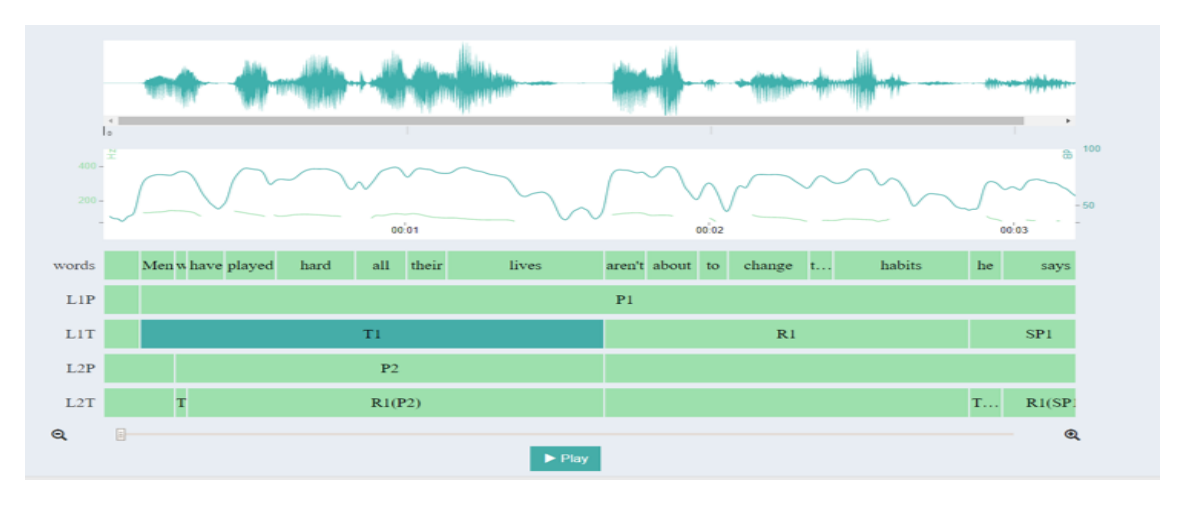
Figure 2: Example of Hierarchical Thematicity visualization.

In the minmax normalization, the minimum value is the starting time of the interval, which is mapped to 0, and the maximum value is the ending time of the interval, which is mapped to 1. So, the entire range of time points is mapped to the range 0 to 1. This gives us an idea of the relative time location of the peak within a time segment (in this case a word). In other words, the computed minmax score provides information on the location of the F0 peak ('maxF0.t') and intensity valley ('minint.t'). Thus, if an F0 peak is located within the first half of the time span, it will have a score between 0 and 0.5, and if an intensity valley is located within the second half of the span, the score will be between 0.5 and 1.