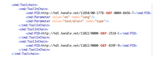
Figure 5: The NER EasyChain in XML (fragment).

A translation mechanism is needed to liaise between Web-Licht and the GEF-enabled services in a GEF environment. Consider a user wanting to annotate sensitive data, say an English text with named entities; for this, the user selects a GEF-based WebLicht workflow, whose corresponding XML representation is given in Fig. 5.