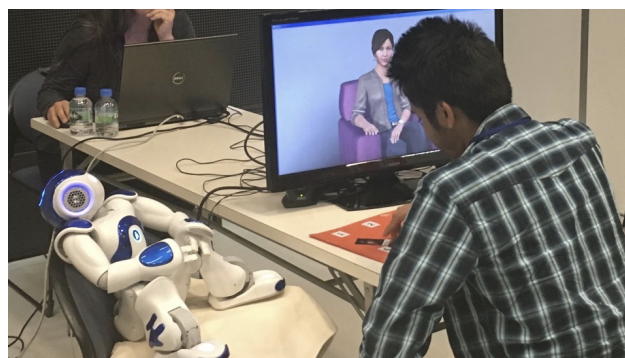
Figure 2: Interaction with Niki and Julie. The wizard is visible in the back because this photo is from a public demo, not an experiment session.

Julie is presented in some dialogues with a virtual embodiment on a screen, while in other dialogues she presents as a voice only, as on a teleconference (Niki is always presented with a physical body). And, in some of the dialogues, Niki makes deliberate conversational errors , designed to simulate communication breakdowns typical of the current state of language understanding technology.