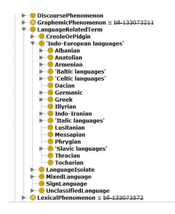
Figure 2: Ontological modeling of the thesaurus branch Indo-European languages : hierarchical structure.

Indo-European languages and Non-Indo-European languages is facilitated by the definition of a new toplevel class LanguageRelatedTerm that serves as a structural anchor. The second hierarchical level comprises classes representing well established language families (e.g., Indo-European languages) as well as classes designating groupings based on typological criteria (e.g., CreoleOrPidgin), geographic location (e.g., Australian languages), or modality (e.g., SignLanguage).