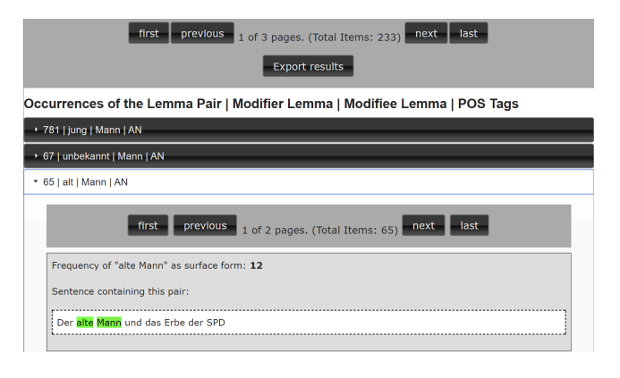
Figure 4: Representation of the search results

Clicking the Export results button lets the user download a .csv file that contains all results from the query and can be used for offline work and further processing steps.