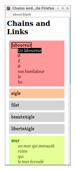
Figure 2: List of all referring expressions grouped by chains. Elements of a chain can be collapsed or expanded, and it is possible to drag-and-drop any element of the list from or to the main window, or vice-versa, to add a coreference relation.

wrong annotations requires an additional cognitive workload; furthermore, referring expressions that are not detected by the tool may be missed by annotators if they rely too much on the tool output. Features like parts of speech may also be annotated with other tools, and checked within SACR.