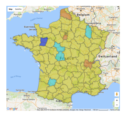
Figure 6: HAC using Eisen's algorithm (4 clusters) with NAs as NAs

rates and relative identity value ("Relativer Identitätswert", RIW) as similarity measure, whereas we recorded recognition rates from the DRF text as continuous values and used Euclidean distance, there are parallels in our analyses. Fig. 7 exhibits overlap with his analysis (Fig. 4) in that the 9 departments in the Southeast ( Haute-Loire , Loire , Rhône , Ain , Haute-Savoie , Savoie , Isère , Drôme , and