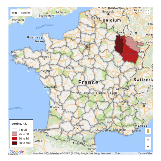
Figure 2: Our visualization of the entry verrine