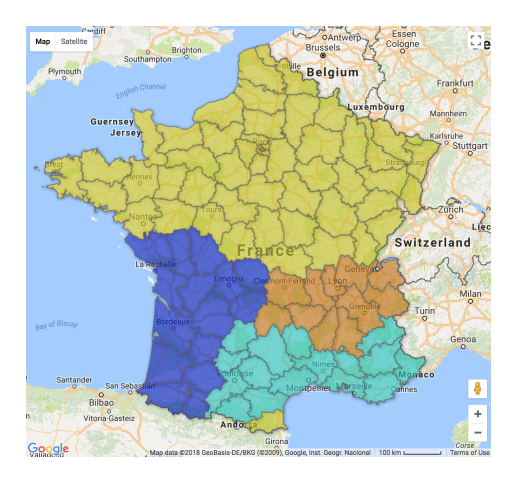
Figure 5: HAC with WARD (4 clusters) with NAs as 0s

rates and relative identity value ("Relativer Identitätswert", RIW) as similarity measure, whereas we recorded recognition rates from the DRF text as continuous values and used Euclidean distance, there are parallels in our analyses. Fig. 7 exhibits overlap with his analysis (Fig. 4) in that the 9 departments in the Southeast ( Haute-Loire , Loire , Rhône , Ain , Haute-Savoie , Savoie , Isère , Drôme , and