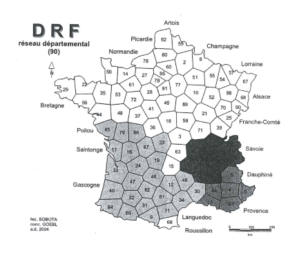
Figure 4: Visualization of 4 clusters from Goebl's analysis; map 22 from (Goebl, 2007).