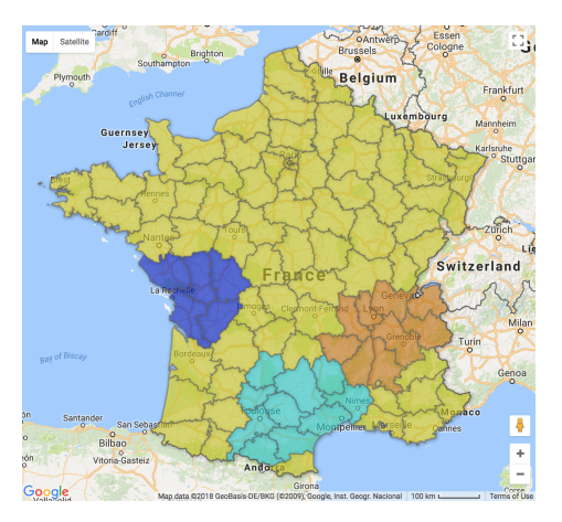
Figure 7: HAC with UPGMA (4 clusters) with NAs as 0s

Ardèche ) form a cluster of their own. This cluster differs from the area with denser entry distribution in the Southeast in Fig. 1, suggesting that the pattern may not merely be contingent on the sheer counts of observations. Yet, the department Pyrénées-Orientales in southern France by the Spanish border shows the tendency to be clustered with the relatively homogenous northern half of France in all of our analyses shown here, mirroring its outlier status in entry distribution.