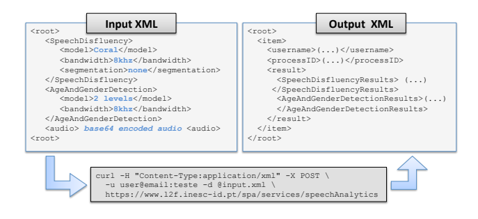
Figure 4: Using the REST API for accessing a SPA service.

same type as the input given, i.e. if the input is an XML file, the output will also be in XML. Audio files can be sent in the same request as the rest of the data, encoded in Base64, or can be simply provided as a valid URL. Figure 4 shows one example for calling a service through the REST API. The example calls a combined service named Speech Analytics that consists of multiple parallel service calls (in this case, speech disfluency, and age and gender classification).