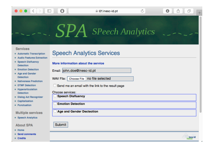
Figure 3: Running multiple modules in parallel.