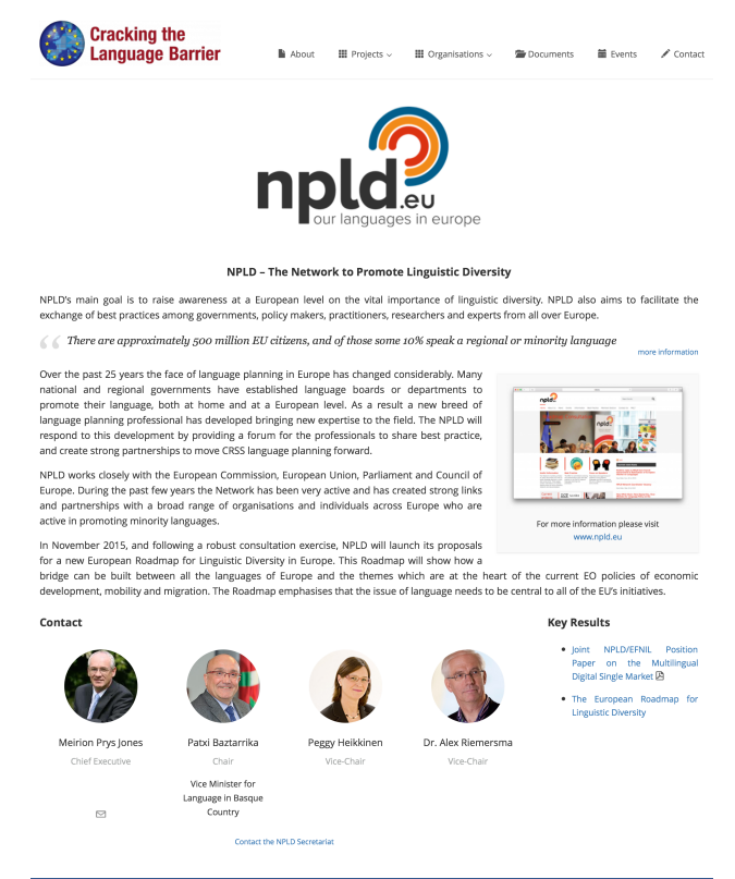
Figure 2: An example organisation page (NPLD)

Additionally, email distribution lists were set up in order to streamline communication and coordination between the participating projects and organisations (e.g., to announce