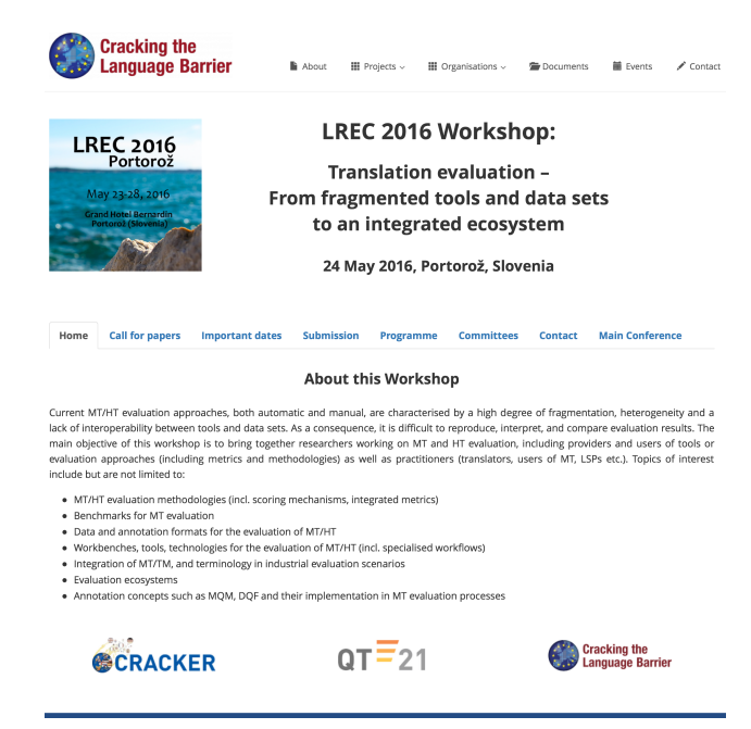
Figure 4: The website of the LREC 2016 Workshop "Translation evaluation – From fragmented tools and data sets to an integrated ecosystem"

eral areas of collaboration were discussed and agreed upon. The following list contains some of these areas of collaboration.