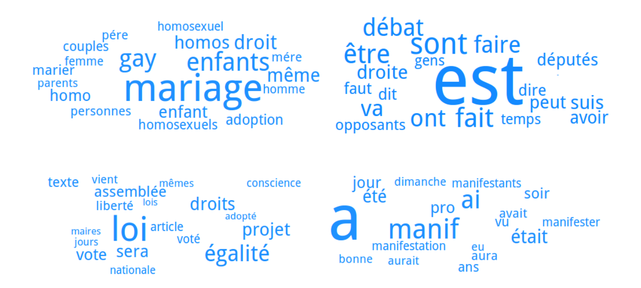
Figure 1: A cloud-style representation of words distribution in the TW-MPT dataset. It includes four sections respectively showing (from left to right and from top to bottom) the more used words for the following semantic areas: family, socio-political debate, legal aspects, public manifestations.