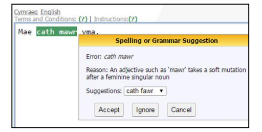
Figure 3: Grammar Suggestions

In this case, Cysill would first identify 'caht' as a possible spelling error and then display a number of possible correct forms for the user to accept or decline as substitutions. Only once the program has run through the entire text identifying potential misspellings and the user has had an opportunity to correct any perceived errors does the grammatical analysis begin. At this point a Welsh-language part of speech tagger is then used to classify the tokens so that a series of grammatical rules numbering in the hundreds may be run on the texts. If any of these rules are broken whilst running through the text, the user is notified with a message stating the expected grammatical behaviour and suggesting a correction.