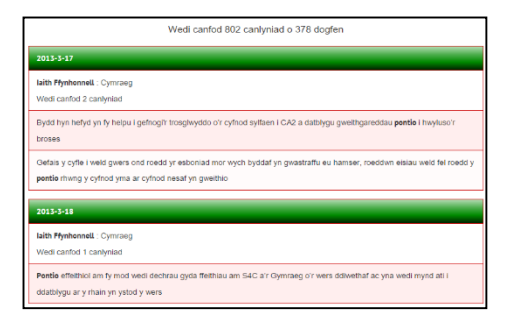
Figure 4: Cysill Ar-lein Corpus Search Results

The Cysill Ar-lein Corpus is currently password-protected and may only be accessed by researchers with the appropriate access rights due to the privacy concerns and lack of a robust Welsh-language anonymization, as reported above. The current interface was therefore initially designed to cater primarily for the internal research interests of the project team, which are mainly related to terminology, lexicography and linguistic register.