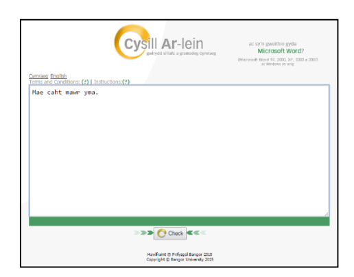
Figure 1: The Cysill Ar-lein interface

The Cysill Ar-lein Corpus is a written corpus of contemporary Welsh created through the novel means of collecting texts from an online spelling and grammar checking service, Cysill Ar-lein. Launched in 2009, Cysill Ar-lein is an online implementation of the popular Cysill Welsh-language spelling and grammar checking tool for Microsoft Windows, first produced in the early 1990s (Hicks, 2004) and updated, repackaged with a compendium of electronic dictionaries, and released as Cysgliad in 2004. Independent studies have since highlighted the popularity of this proofing tool and its role in supporting use of Welsh in computing, online and multimodal environments (Prys, 2008). In 2015, the Cysill Ar-lein interface was made available to external developers to embed in their own websites using an API key available from the Welsh National Language Technologies Portal (2015).