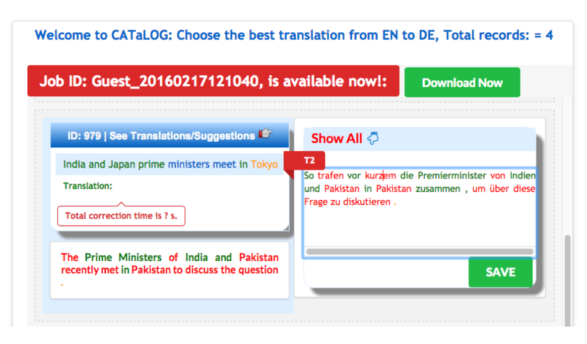
Figure 3: Colour coded TM suggestion CATaLog online

Lucene retrieval score. Like MateCat, CATaLog online records editing logs such as keystrokes, exact millisecond-level timing and editing costs. An additional feature of CATaLog online is the colour-coding of the TM suggestions, both source and target, rendering the matching segments between the two sentences. An another additional feature of CATaLog online is the polling system which allows the translator to decide whether the MT or TM translation was the most appropriate alternative.