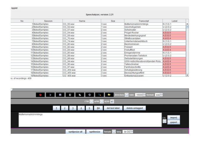
Figure 3: The Speechalyzer user interface used for the annotation task

open source text-to-speech system Mary developed by the DFKI (Schröder and Trouvain, 2003). For Mary, we used the latest stable version available in late 2014, namely version 5.0 with non-uniform unit-selection voice "dfkipavoque-neutral". We felt that this voice gives the best comparability to the commercial system, which also was based on non-uniform unit-selection.