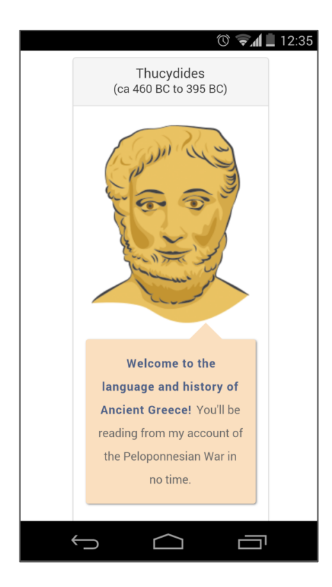
Figure 3: Historical Languages eLearning Project on a mobile device

Since the system relies on complex and structurally varied textual data, the challenge lies in storing this data in a scalable way, which stays true to the real world objects (e.g. sentences and documents). Our chosen graph model is capable of both supporting the user interactions in the application as well as representing this textual data in a way that the application can use it to generate dynamic exercises. Owing to its schema-free nature, graph databases are also easier to extend and maintain than traditional SQL databases.