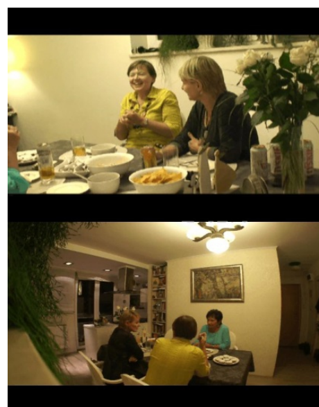
Figure 2: Snapshots from the Polish data

In Figure 2, two screenshots of the Polish data are shown.