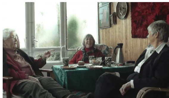
Figure 1: Screenshot from the Danish data

2011). In Figure 1 is a screenshot from the Danish corpus.