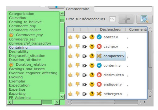
Figure 1: Snapshot of lexicon adjudication, via the Asfalinks GUI.

the adjudication mode of the lexicon. The lemma abriter.v has been validated by all annotators as frame-evoking element for the Containing frame, while cacher.v has been refused. The lexical unit comporter.v has conflicting status, which must be resolved by the adjudicator.