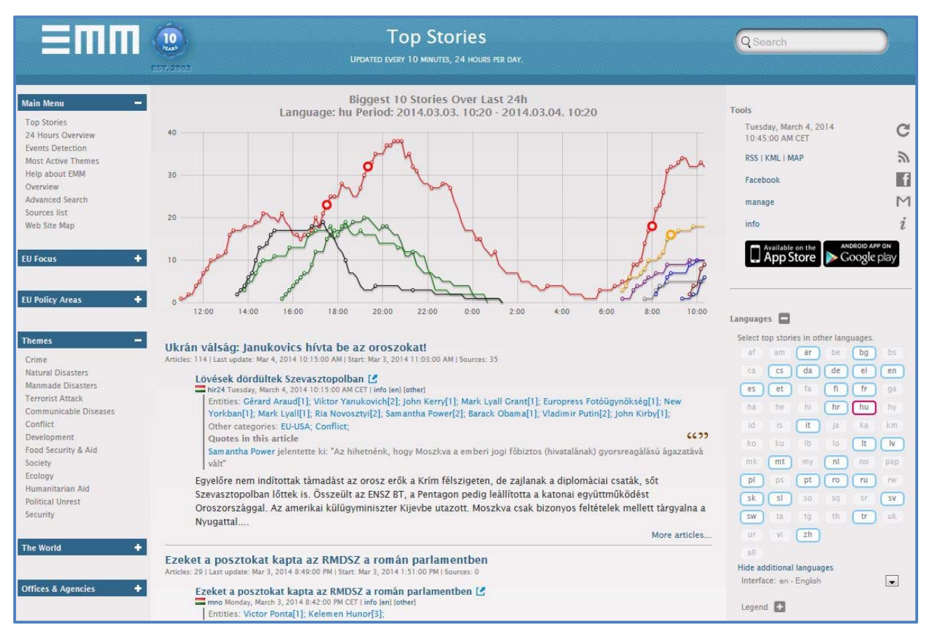
Figure 1. EMM-NewsBrief page showing the major current Hungarian language live news and their development over the last 24 hours, together with information automatically extracted from each news cluster, including news categories, names and quotations.